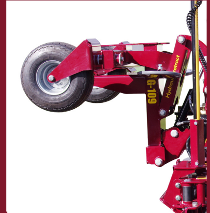
Retracting front chassis gets into corners