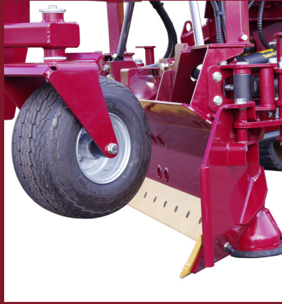
Hydraulic wings control material in both directions