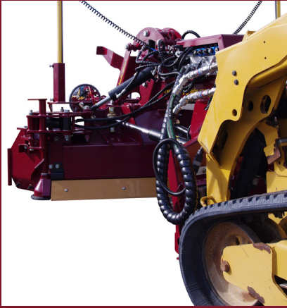
Rear blade to precision grade in reverse